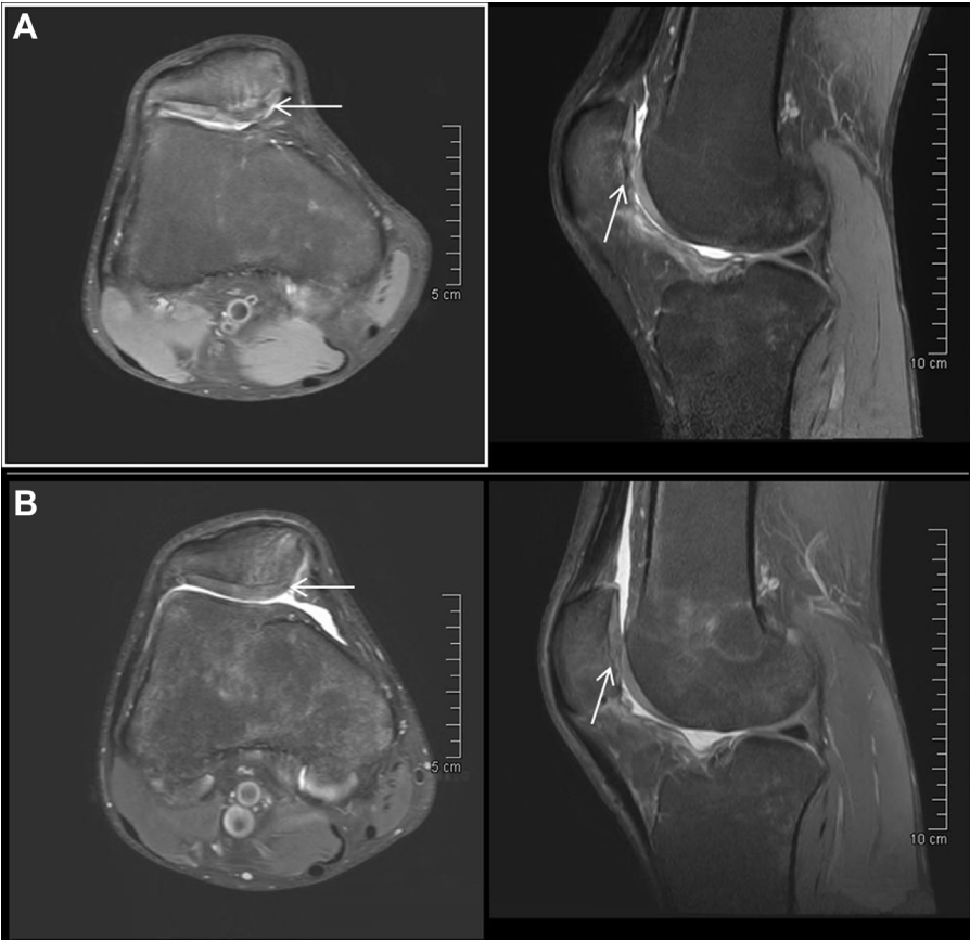
Fig 3. Axial (left) and sagittal (right) views of magnetic resonance imaging (echo-planar diffusion weighted sequence, fat-suppressed) (A) before and (B) 8 months after MACH for failed AMIC surgery. The magnetic resonance imaging results indicate good integration and filling of the retropatellar defect (arrows). The subchondral bone edema is markedly reduced 8 months after surgery.

The defect is exposed by arthrotomy (Fig 2A), either medial for the patella and/or trochlea or lateral/medial for the femoral condyles, and the borders of the cartilage defect are prepared with respect to containment, removing all damaged and degenerated cartilage tissue down to the subchondral lamina (Figs 2B-2D). In contrast to the microfracture and AMIC techniques, perforation or abrasion of the subchondral bone is not desired to avoid injury to the bone, which can lead to bone pathology or chronic bone reaction. The violation of the subchondral bone might result in a